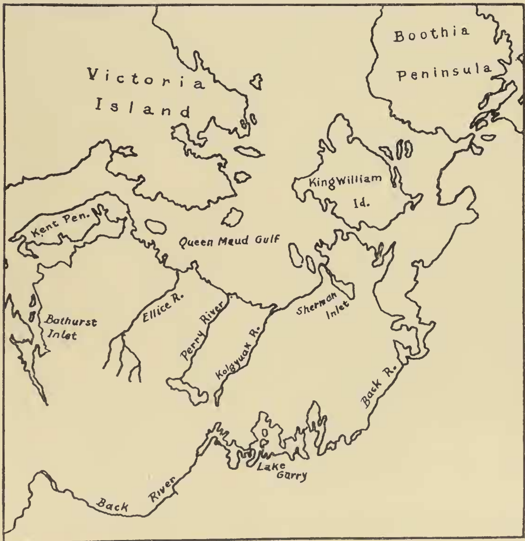
Figure 1. Perry River region.

The post is about 75 miles north of the Arctic Circle, near the mouth of the Perry River (Lat. 67^{\circ} 48' N. ; Long. 102^{\circ} 10' W. ) which empties into Queen Maud Gulf. For convenience, I repeat here with only slight variation a description of the district given in my earlier paper on the mammals (1945. Jour. Mamm. , 26:226-230). To the south, from the coast to the Garry Lake-Back River system, some 85 miles inland, lay an unmapped and unexplored territory. The Ellice